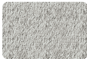
Magnified image of standard plasterboard