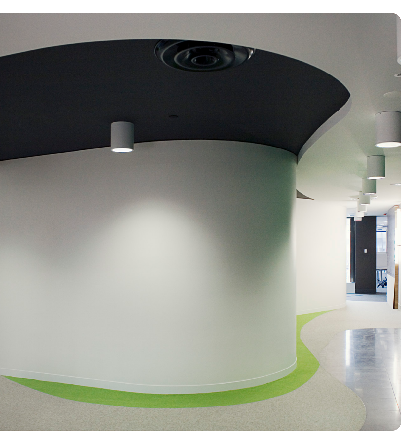
curve shield can be used in residential and commercial applications.